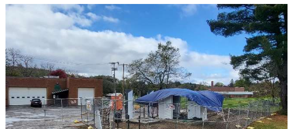
DC Fast EV Chargers Under Construction at Angelica Village Offices

Another area of continuing activity for MEUA and our members is NYPA's EVolve NY program, under which NYPA has been working with a number of our systems to expand the State's network of Level 3 Direct Current Fast Charging stations to support New York's goal of increasing electric vehicle usage. Fairport and Bath were two of the early recipients of NYPA fast chargers. Richmondville went online