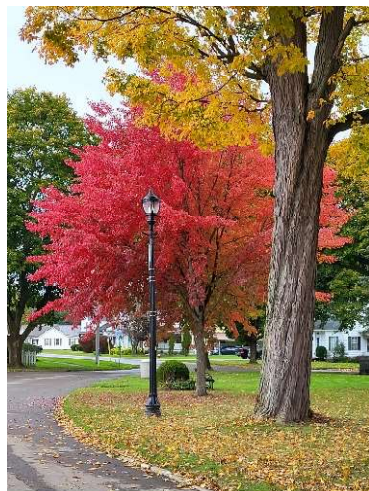
Belmont Village Park in Allegany County

A number of our MEUA systems have submitted applications for funding under NYSERDA's PON 5737 for distribution system studies and upgrades.