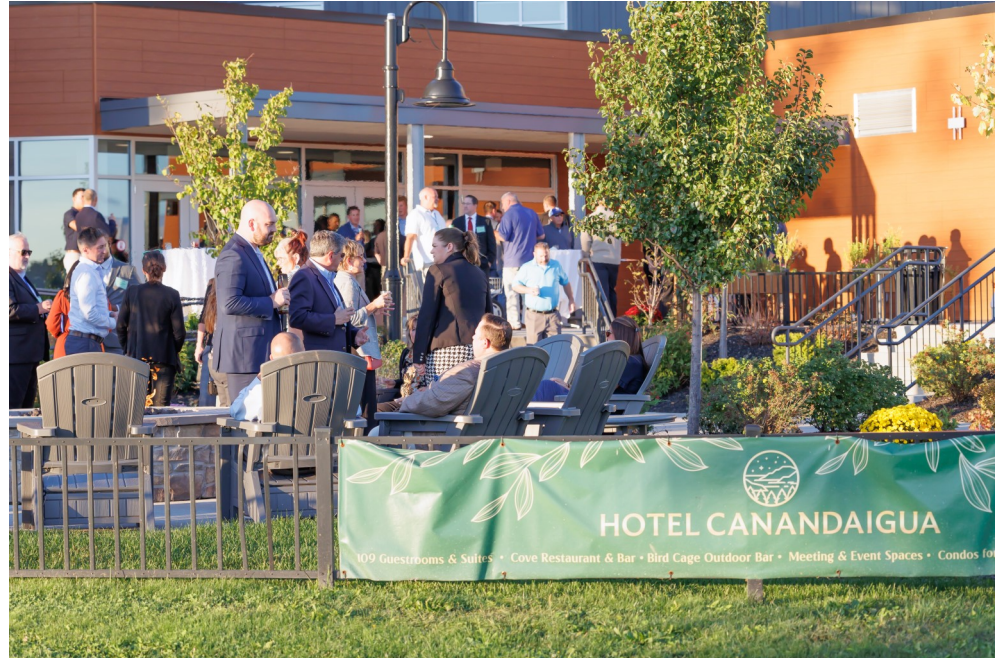
Attendees of the 94th MEUA Annual Conference enjoy a cocktail reception by the lake on the patio of the Hotel Canandaigua.