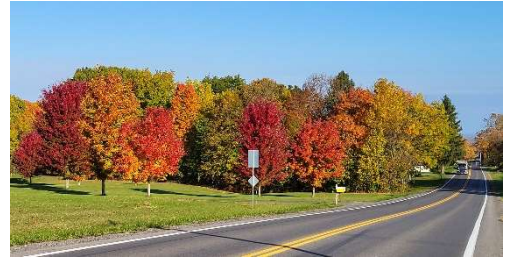
Country Road in the Mohawk Valley

I can't recall a year with more spectacular fall foliage. This isn't the first time you have heard me remark about the natural beauty of upstate New York, and likely won't be the last, so I hope you don't mind as I share a few shots from my windshield.